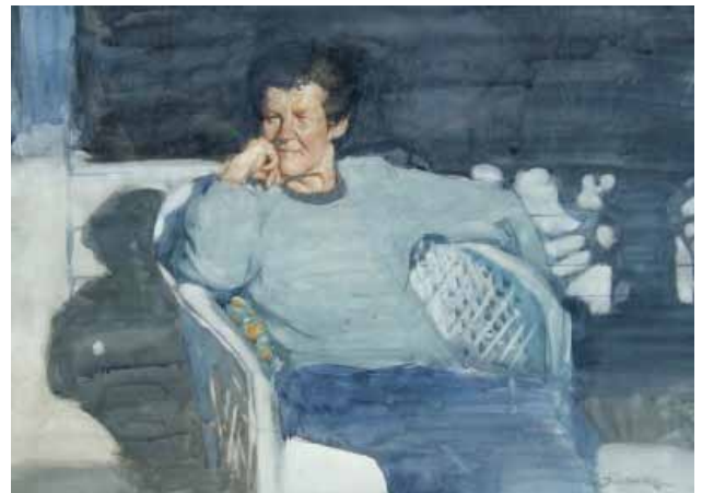
October Light'- 19.5 x 27" watercolor