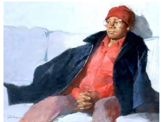
Jenny' 18 X 24, Oil