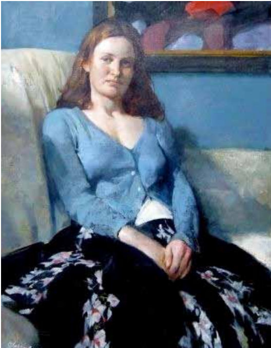
'Girl in Blue Sweater' 26 x 20 oil

1980 Doll & Richards Gallery, Boston 1979 Capricorn Galleries, Bethesda 1977 FAR Galleries, NYC 1977 Meredith Long Galleries, Houston 1974 Harbor Gallery, LI, NY 1971 Harbor Gallery 1970 Kenmore Galleries, Phila. 1970 Gallery 52, So. Orange, NJ 1970 FAR Galleries, NYC 1967 University of Utah 1965 Kenmore Galleries, Phila. 1965 FAR Galleries 1963 Kenmore Galleries, Phila. 1962 Davis Galleries, NYC 1958 Davis Galleries 1956 Davis Galleries